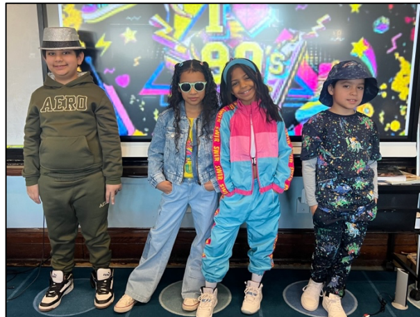
90 th Day of School...90s Style!