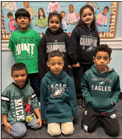
Eagles Super Bowl Excitement!